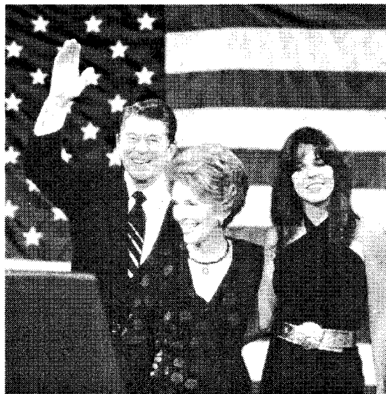
President Reagan with the First Lady and daughter Maureen.

At a Capitol luncheon later in the day, Reagan said he could not quite recall taking the oath two hours earlier. He also said he was having difficulty remembering exactly what he had said there, or if, in fact, he had been there at all.