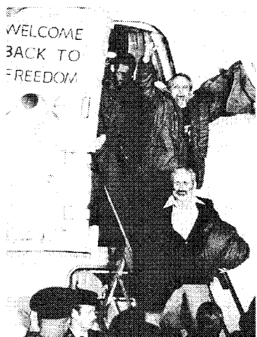
American hostages, held in Iran for 444 days, arrive at a U.S. airbase in West Berlin Tuesday.

"Please," Reagan added, "do not put two and two together." Vice President and former CIA Chief George Bush, whose shady Mideast connections were not officially used to broker an arms-for-hostages deal, agreed. "With new leadership